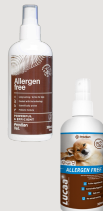
Provilan Allergen Free Spray